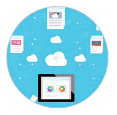
COPY WRITING SERVICES