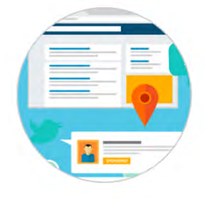
SOCIAL MEDIA MARKETING